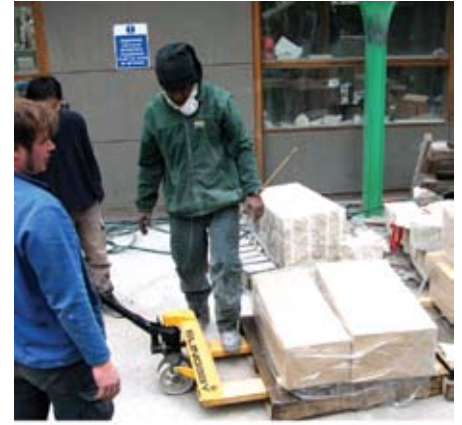
The stone arriving at City & Guilds