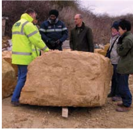
Visiting Syreford Quarry to select the stone.

In March 2006, 15 completed models were presented to the Sculpture Committee and eight of these were selected for carving - 3 for the lower corbel and 5 for the upper.