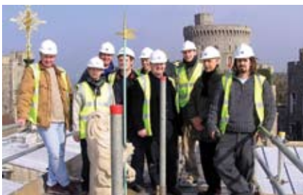
Site visits to St George's