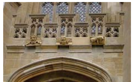
Casts of proposed models placed on lower corbel